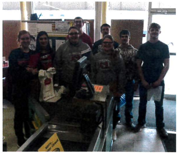
The Personal Finance students had a great time shopping for their two weeks worth of groceries at M&M Market.

Junior High Computers will be working through many technology-based projects shortly. Be sure to check the sites for their projects they complete and take a look at them. As always, It's A Great Day To Be A Patriot!